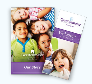
Don't forget to pick up Our Story and a Welcome Brochure!

3094 W. Market St., Ste. 260 Akron, Ohio 44333