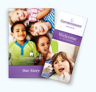
Don't forget to pick up Our Story and a Welcome Brochure!

3094 W. Market St., Ste. 260 Akron, Ohio 44333